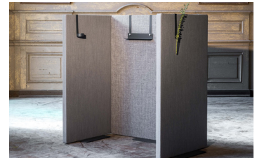
Flexible magnetic connection U-position