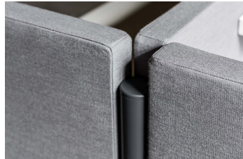
Full screen with magnetic connection with connecting post