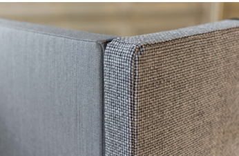
Full screen with magnetic connection without connecting post