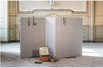
Full screen with flexible magnetic connection