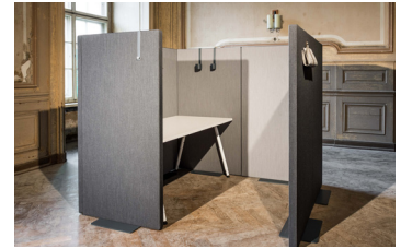
Flexible magnetic connection project workplace