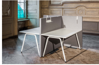
Flexible magnetic connection T-position