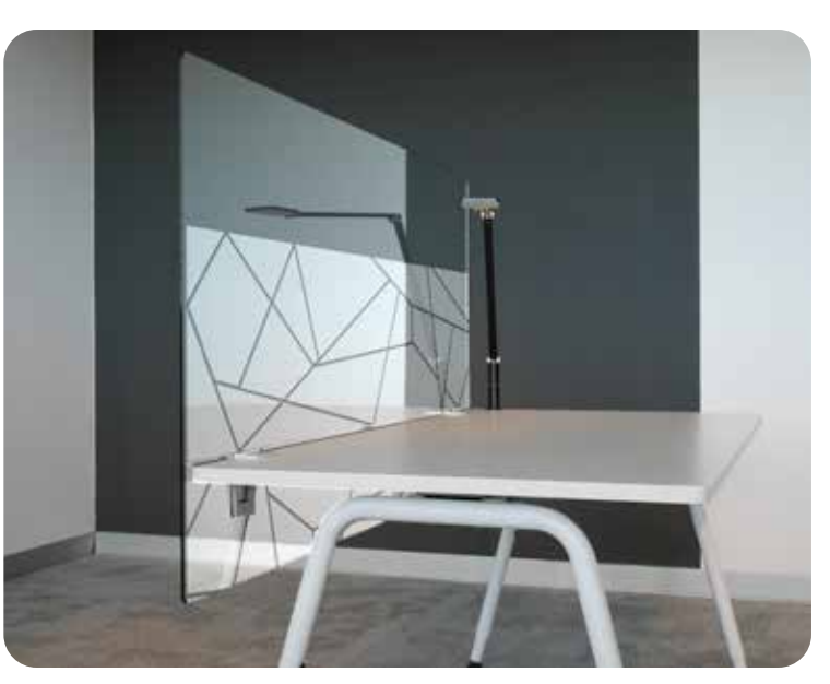
Top: Table top screen Bottom: Behind-desk screen with "mikado" foiling