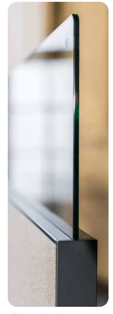
Silence Line element with glass topper