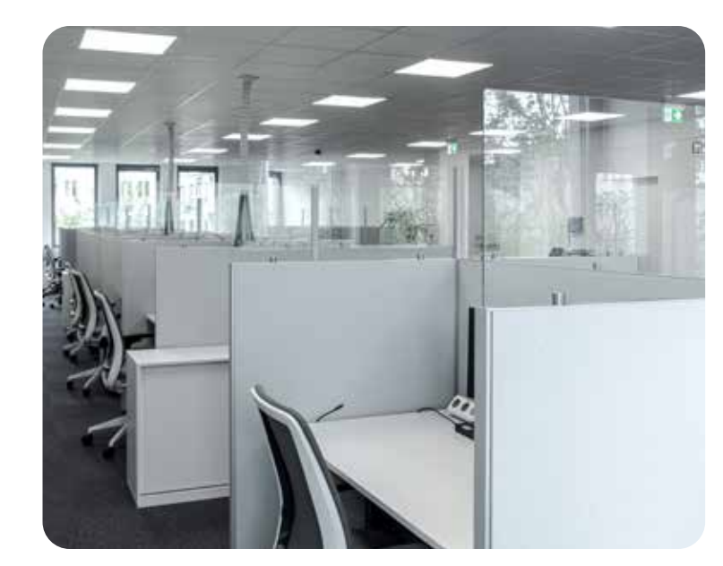
Top:Prime Line 55 table element with glass topperBelow:Prime Line 40 movable wall and table elements<br/>with glass topper